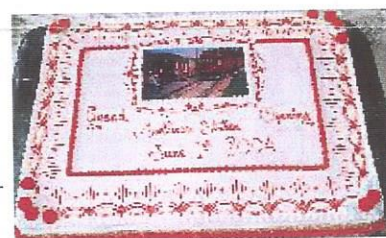
The Grand Opening Cake!