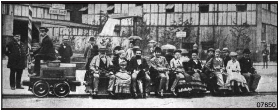
1879: The first electric train is built by Ernst Werner von Siemens (1816 – 1892) at the Berlin Industrial Exhibition. 30 passengers are hauled around a circular 600 yard track by a 5 horsepower locomotive at a speed of 4 miles per hour

FUND RAISING: The Society has raised about $900,000 in cash or kind for our various projects as of this writing. We are $75,000 away from acquiring BCER Car 1225 (price $300,000 Cdn). We have made a number of presentations to various financial institutions, all of whom have provided encouragement and support.